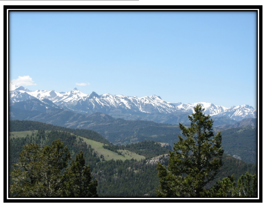
Absaroka Mountaín Range