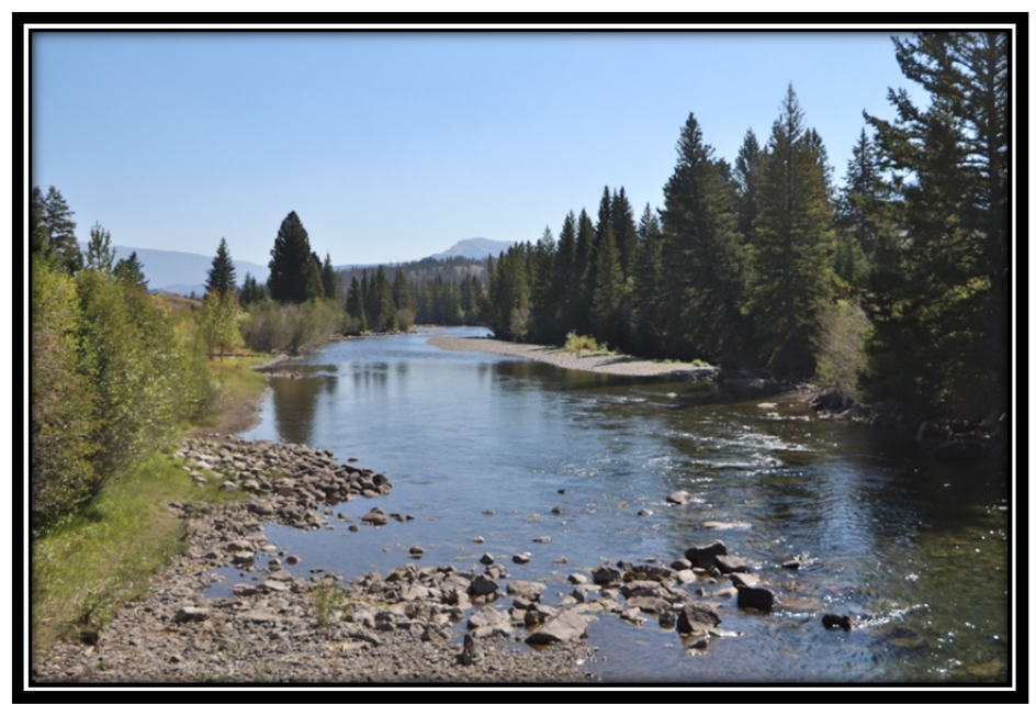
Clarks Fork Ríver